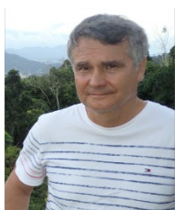
Janusz Pawliszyn (University of Waterloo - Canada)

Peptide quantification at the picomolar level in volume-limited biological samples: obstacles to tackle